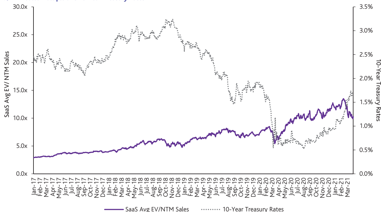
Average SaaS EV/NTM Sales Multiple and 10-Year Treasury Rates