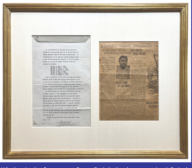
Whether in the Bronx or at Baron Capital, there's no escaping inflation's awesome compounding power. Babe Ruth's first contract as a Yankee in 1919 for $40,000 annual salary compares to Aaron Judge's $40,000,000 annual contract today. That's a 6.8% compound annual rate of salary inflation for the past 104 years if you're keeping score at home.

only $.07 (seven cents)!!!!...Accordingly, tuition...homes...salaries ...cars...food...travel... real estate...consumer products and just about everything else are all about 15 times more expensive now than 70 years ago!