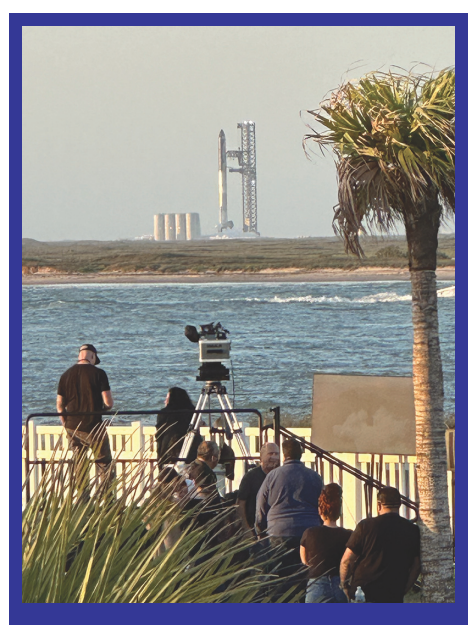
"When we look back in history, I believe this will be the day when we mark the technological breakthrough of building a vehicle that can actually go to Mars."

We believe Starlink will become the backbone for satellite broadband internet for the world. SpaceX can increase Starlink's innovative broadband capacities with software...not just by adding next generation satellites! Telco wired connections to remote homes cost approximately $16,000 per mile. This compares to $500 for a Starlink plug-and-play user interface antenna! Accordingly, Starlink could provide telcos, commercial customers, and government customers with the backbone for broadband everywhere.