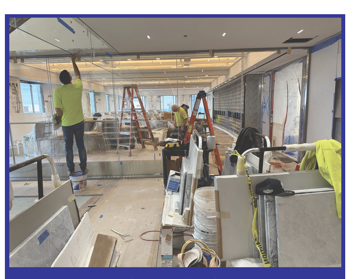
Just as we favor companies that invest in themselves, we are investing in Baron Capital by significantly expanding our New York City offices. We expect the result – superior products and services for our customers – to be true for our business as those in which we invest. We expect this expansion to enable our fellow workers to work more efficiently together... and benefit investors for whom we manage money.

Thank you for joining us as fellow shareholders in Baron Funds. It makes me feel especially good when people stop me on the street or seemingly wherever I am to say, "Thank you." Virtually every day. It also made me feel good when I recently opened a fortune cookie to find, " People rely on your dependability " as my fortune.